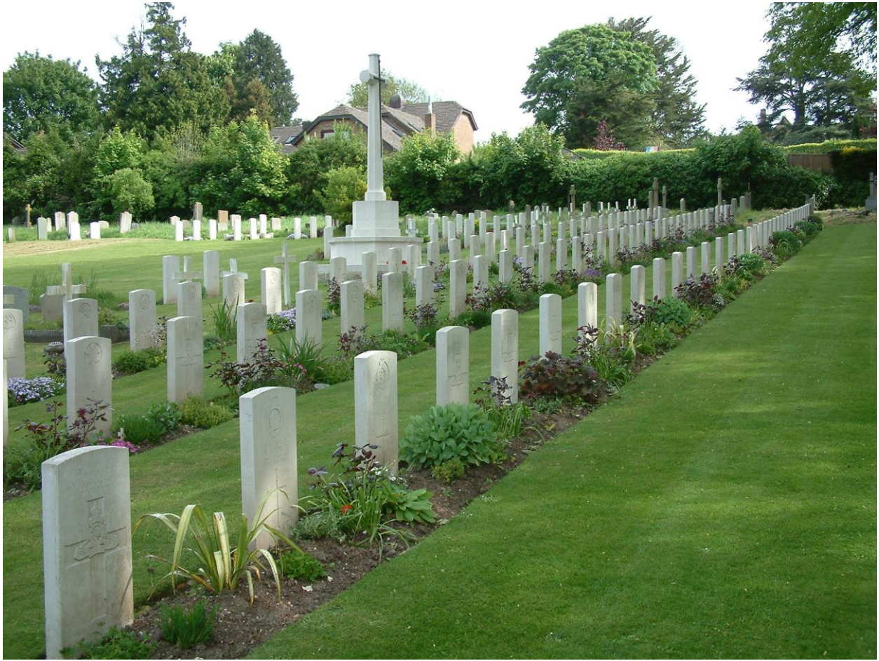
Christ Church Military Cemetery, Portsmouth