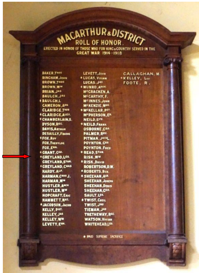
Macarthur & District Roll of Honour