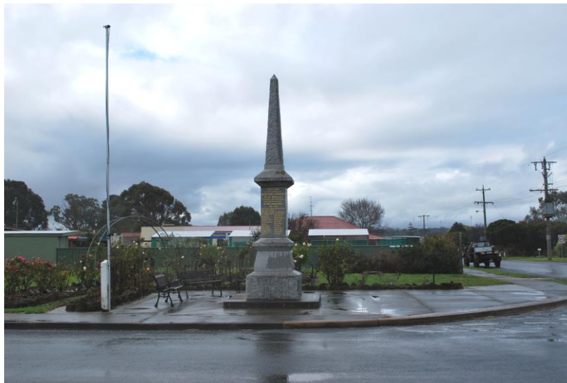
Macarthur War Memorial